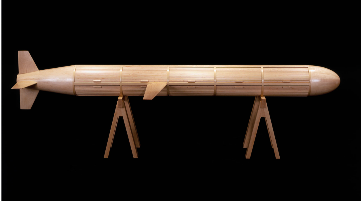
Los Carpinteros Panera. 2004