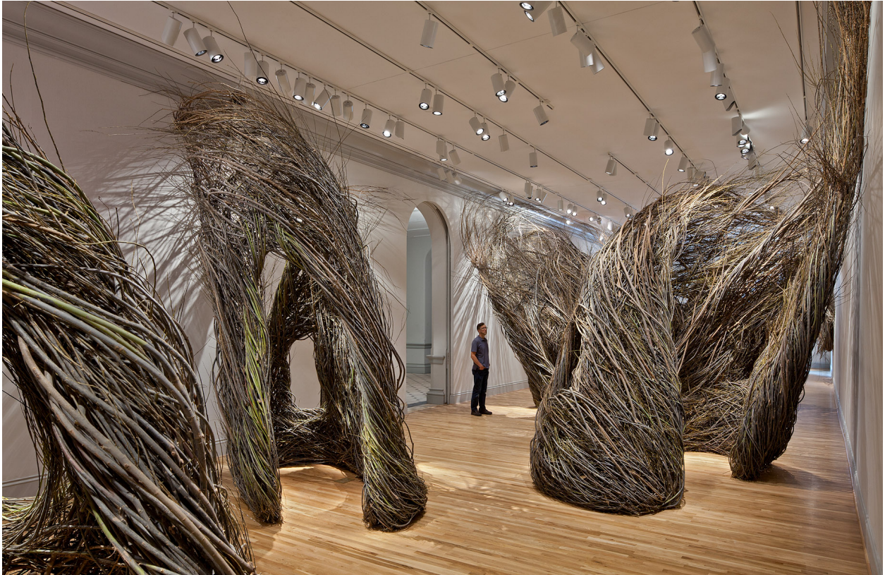
Patrick Dougherty Wonder. 2015