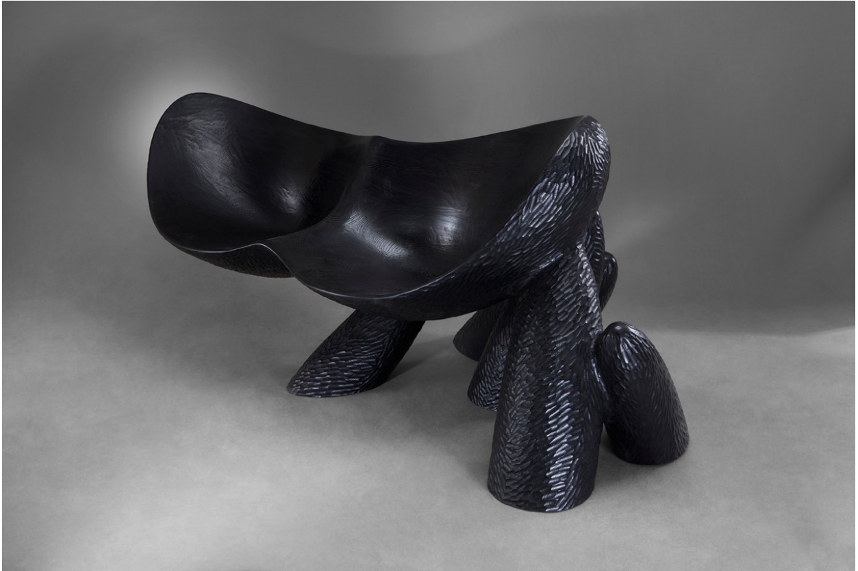
Wendell Castle Black Star. 2010