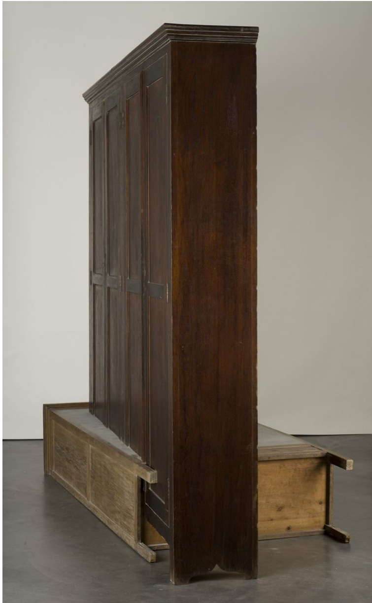
Doris Salcedo Untitled. 2008