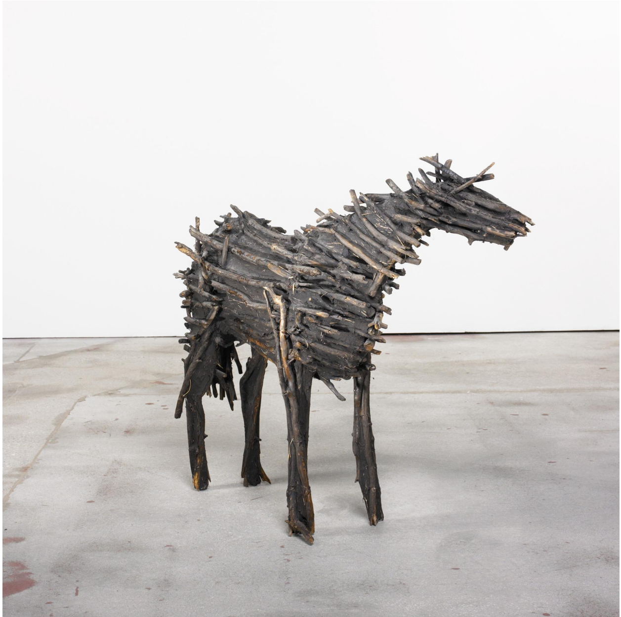
Deborah Butterfield Horse. 1979