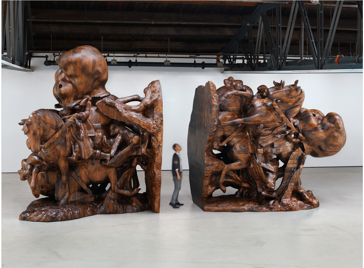
Paul McCarthy Snow White Bookends. 2013