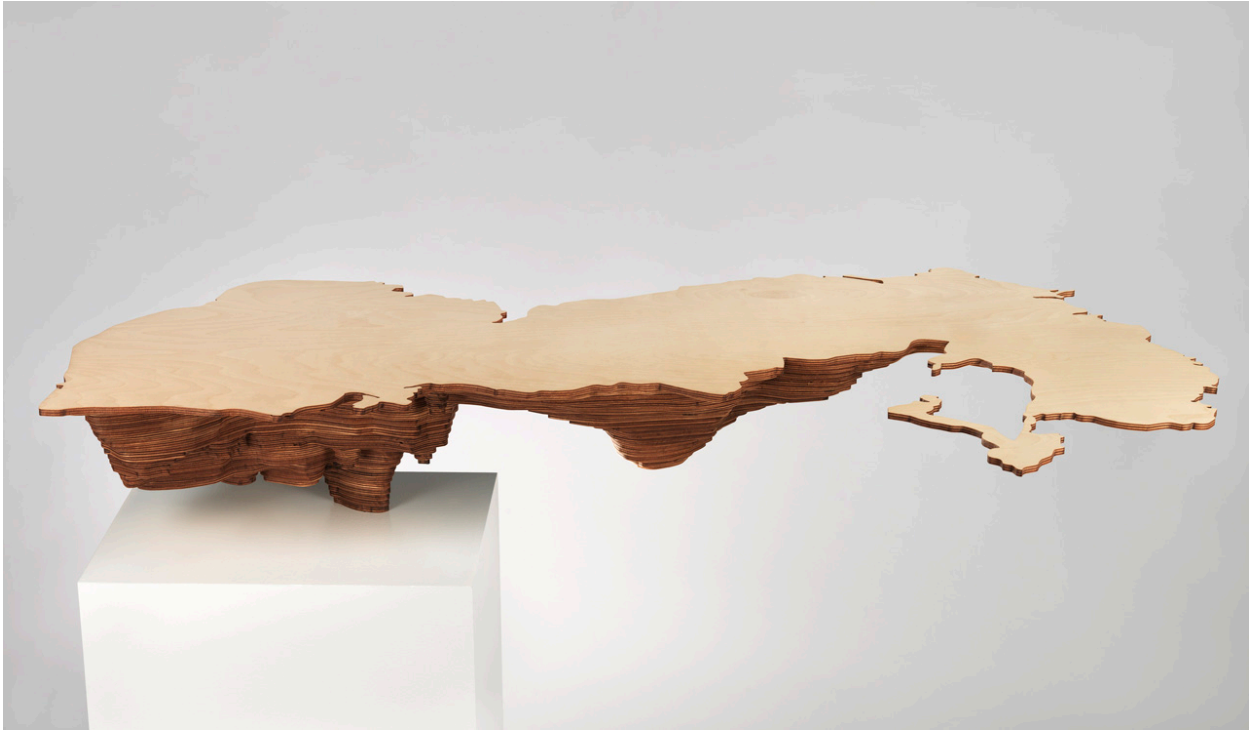
Maya Lin Caspian Sea. 2006