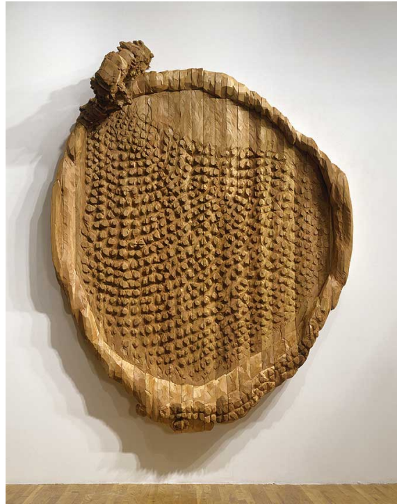
Ursula Von Rydinsvard